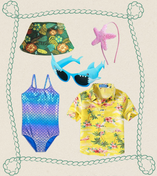
OASIS POOL PARTY