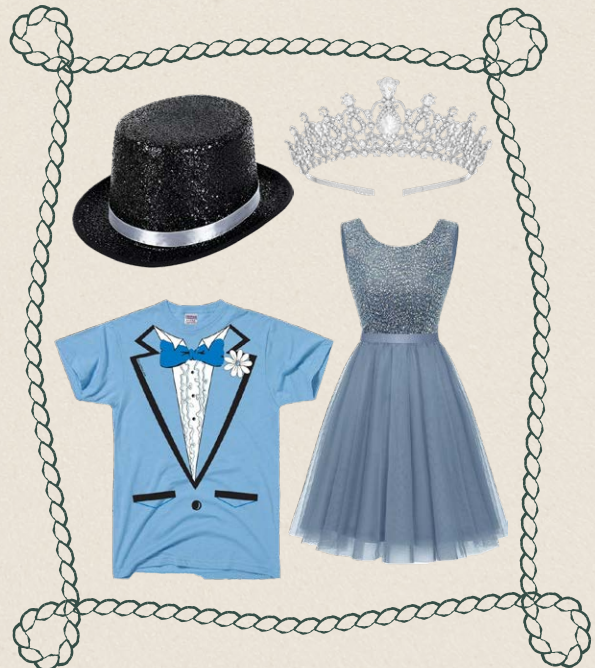
PROM UNDER THE STARS