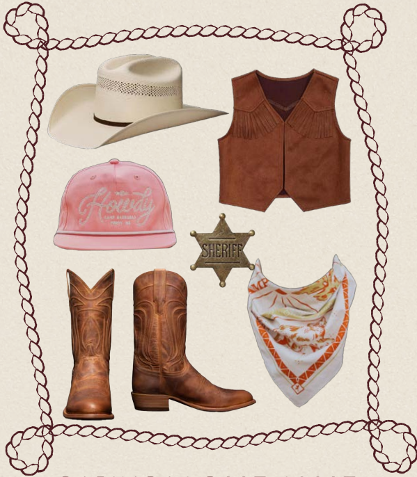
BARNABAS BOOT SCOOT

At Camp Barnabas, we don't just throw parties. We throw rootin' tootin', boot-scootin' good times. Costumes are encouraged but not required. We've included a few ideas to help plan for packing.